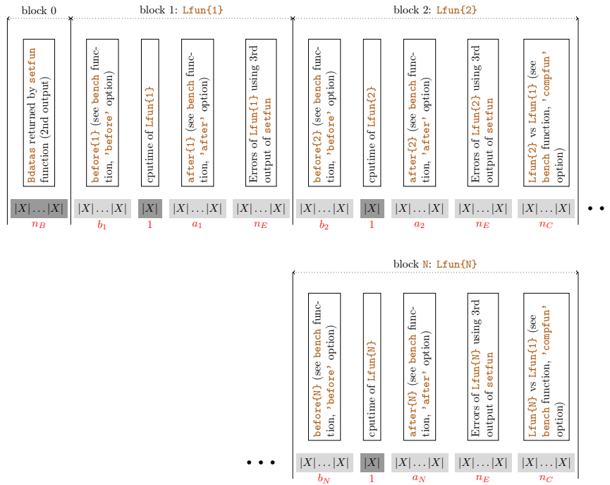
Figure 1: Description of columns of the bench. Each |X| represents one column. Columns with light gray background are optionals. Below each subblock (boxes with gray background), the number of columns is given.

In Figure 1, we represent how columns are constructed by the fc_bench.bench function.