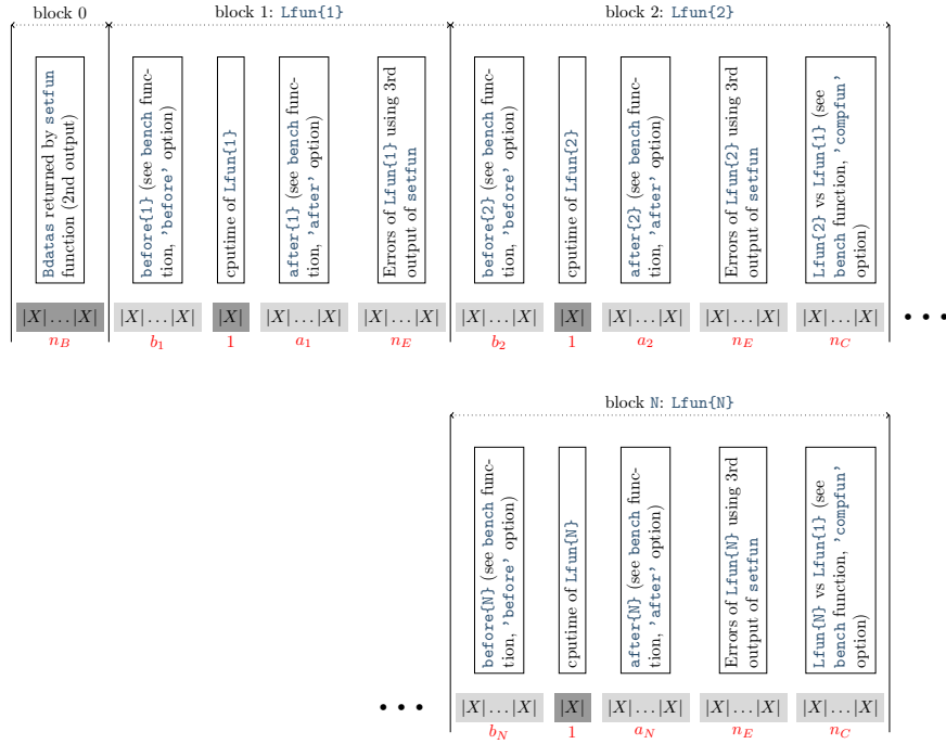
Figure 1: Description of columns of the bench. Each |X| represents one column. Columns with light gray background are optionals. Below each subblock (boxes with gray background), the number of columns is given.

In Figure 1, we represent how columns are constructed by the fc_bench.bench function.